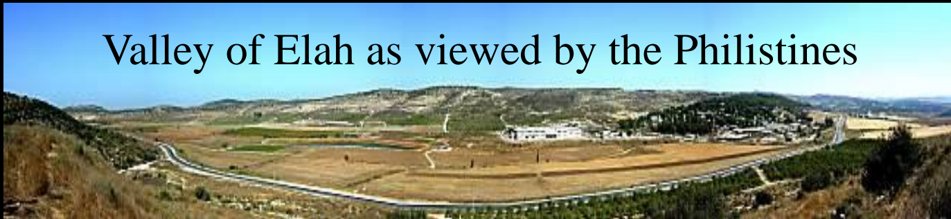
Valley of Elah as viewed by the Philistines